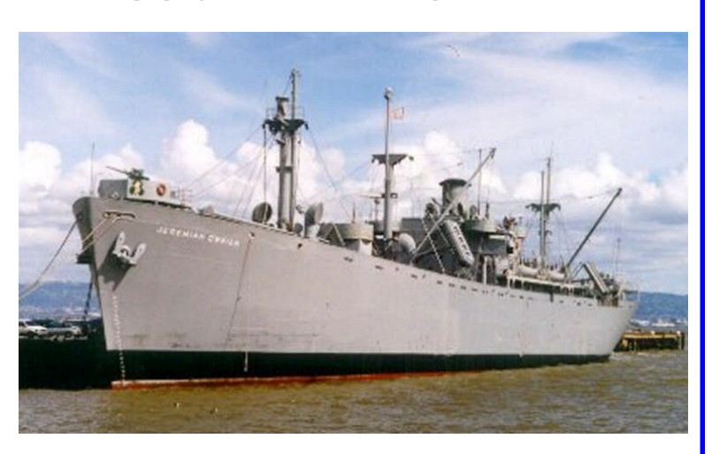
The Historic Ship that Sails

All cruises are day trips; price includes meals, beverages, entertainment, activities, and live 40s music. Explore the ship while underway and steaming—INCLUDING a visit to the engine room! Chat with crew members, some of whom are World War II Veterans. Educational and FUN...an unforgettable experience!